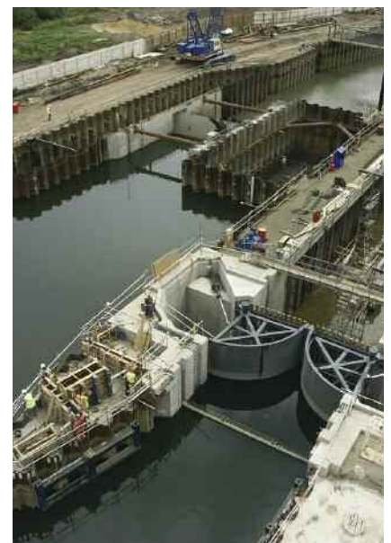
Work in progress in the Prescott Channel

“We supplied six plasma-cut polished plates to Volker Stevin, the design and build contractor”